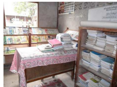
Neatly arranged shelves