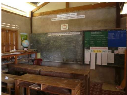
Classes are conducted in this very small space.