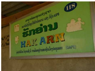
"Hak Arn" - Love to read in Laotian language