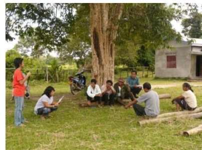
The leaders were very eager to discuss more