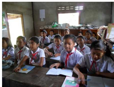
Each class is packed with students