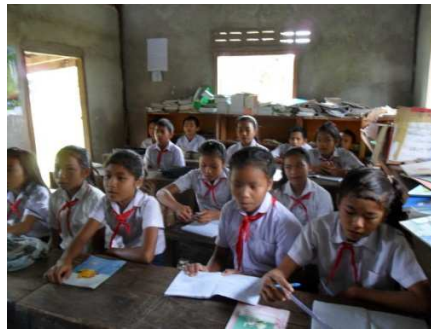
Secondary students who are very eager to study