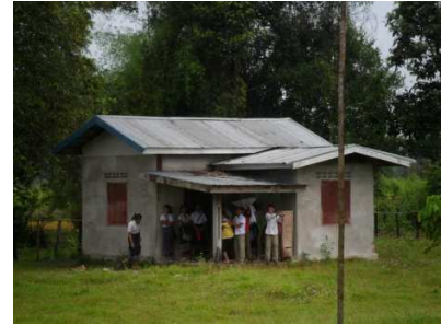
The primary school's library