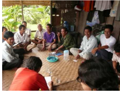
Meeting with the community leaders