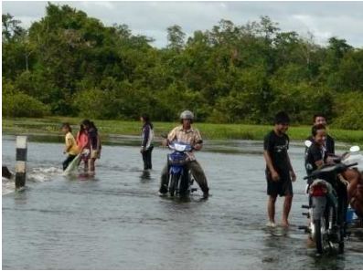
Flooded roads during the rainy season