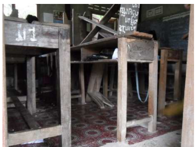
Broken furniture continues to be used