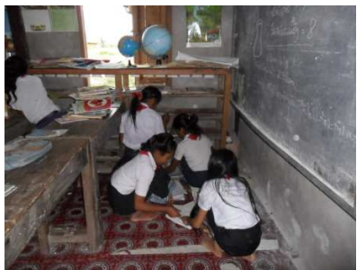
Students preparing for classes