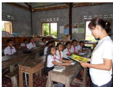
Child's Dream staff talking to the students