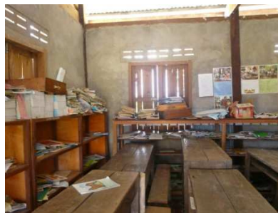
Inside the library where lessons are held