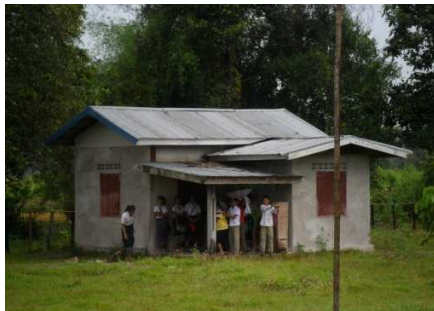
The library that was converted into a classroom