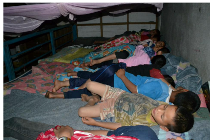
The boarding house is overcrowded