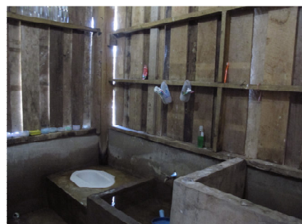
The condition of the facilities is very poor and the house lacks light and ventilation