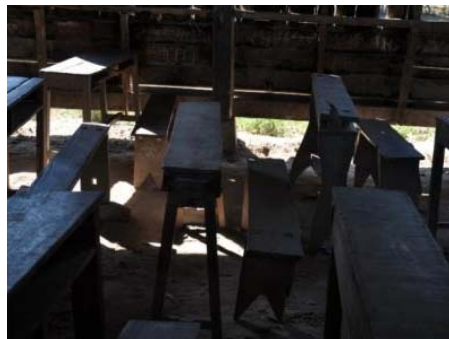
Floors turn muddy, especially during the rainy season