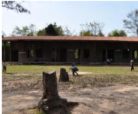
Welcome to Phon Ngam Primary School