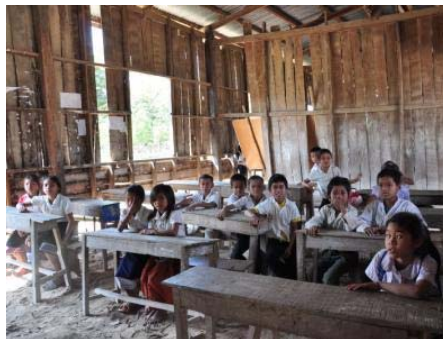
Inside the current classrooms / dirt floor