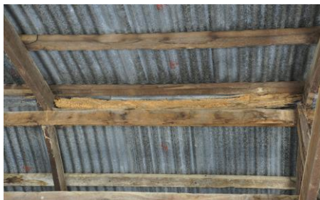
The wooden beams and walls are infested with termites and can collapse any time.