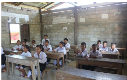
Students studying in the unfinished concrete building with unfinished cinder block walls.