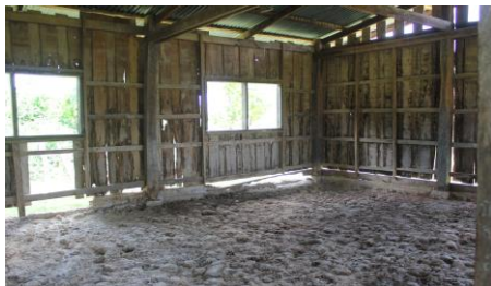
One of the two wooden buildings has become so rundown that it can no longer be used and is in dire need of replacement.