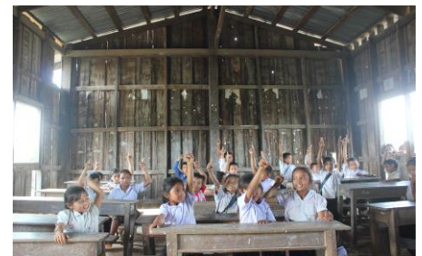
Although it's dilapidated, the other wooden building is still being used by some grade levels.