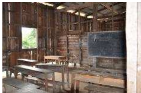
Inside the classroom