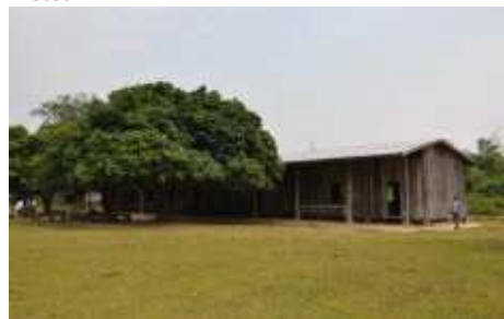
This school was built in 1983