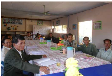
Meeting with the community leaders