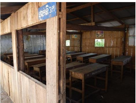
The temporary classroom is not at all conducive for learning