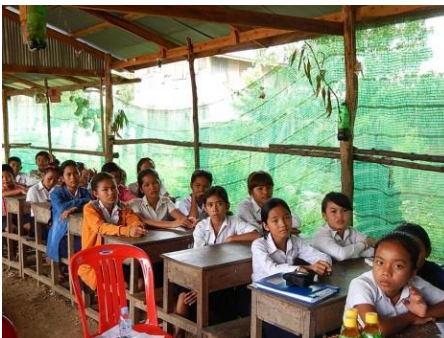
No walls to shelter the students from the harsh weather conditions