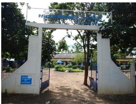
Welcome to Pich Chenda Primary School