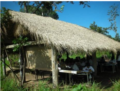
The existing temporary secondary classroom