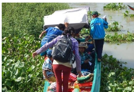
No more dangerous boat travel for borderers