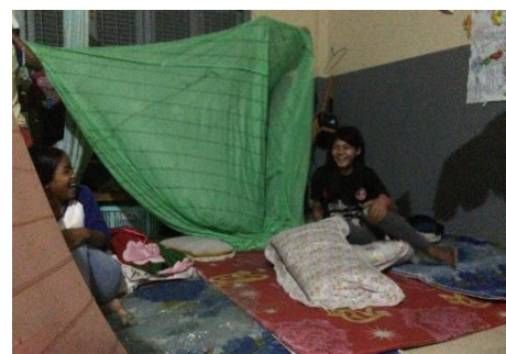
Students staying in classrooms during weekdays