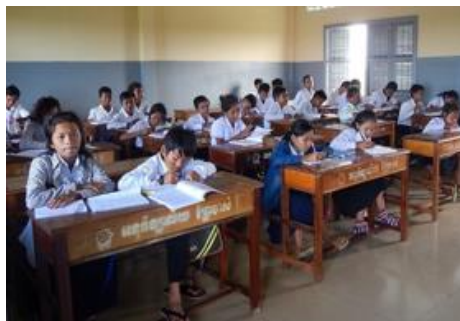
Students at our Prey Chas Secondary School