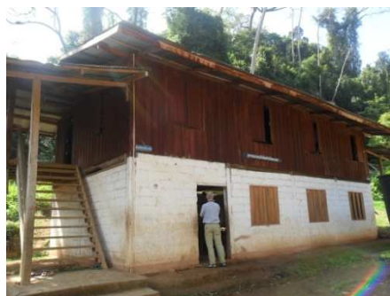
The existing boarding house