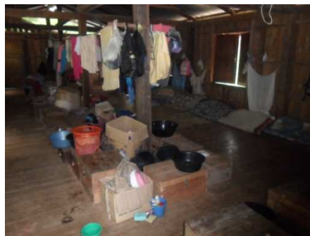
The girl's floor, upstairs