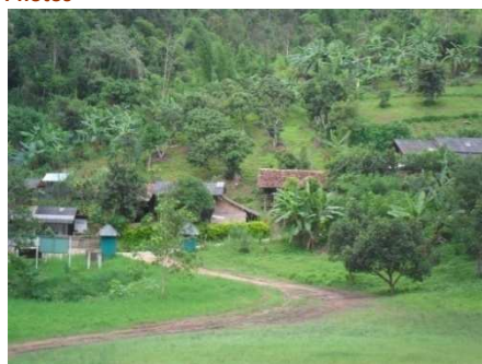
The hilly location of the school