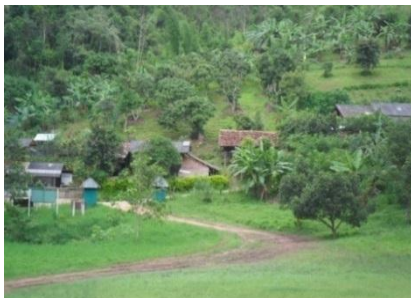
The hilly location of the school