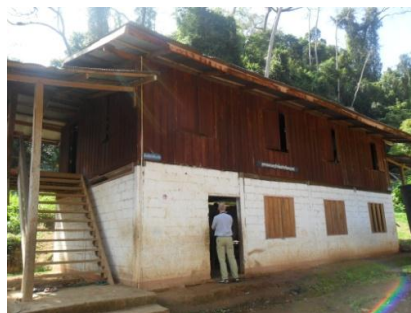
The existing boarding house needs renovation