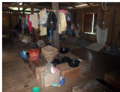
The boy's floor, upstairs