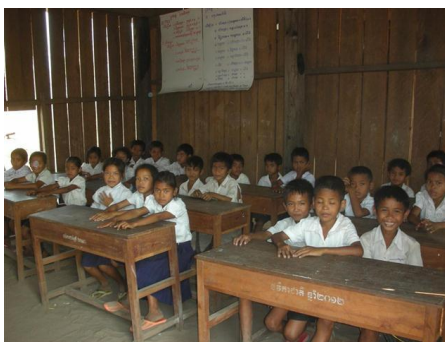
Crowded classrooms with dirt floors