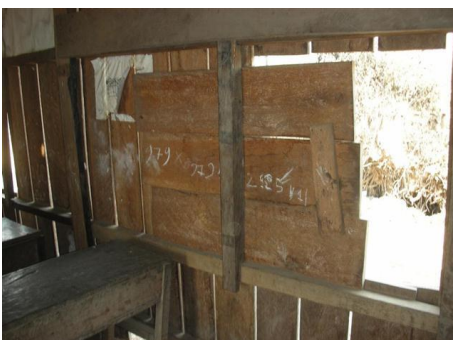
Patched up walls and open to the rain