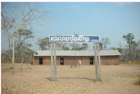
Welcome to Rolum Tbal Primary School