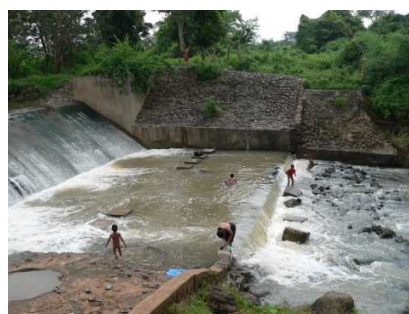
Students taking their shower in the nearby river