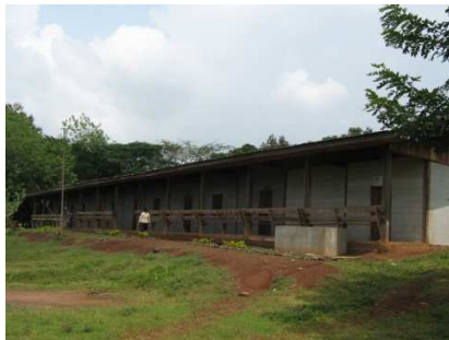
The existing school building needs renovation