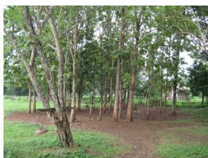
Location of the future playground