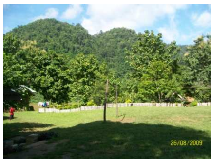
...sufficient space for a new nursery building