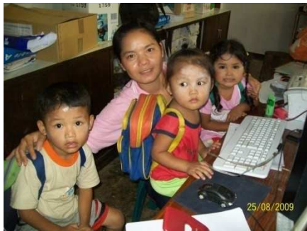
The nursery school children in the computer room