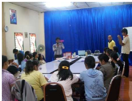
...discussions with the villagers