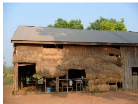
The building walls