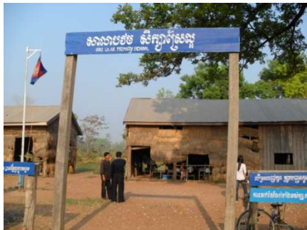
The school gate