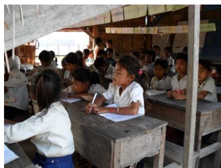
Inside the classroom