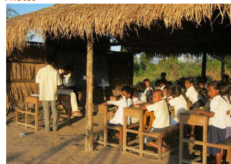
Current classrooms without walls