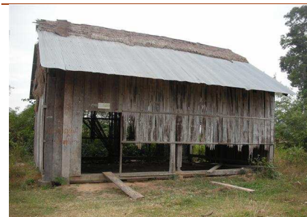
Another of the buildings