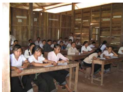
Many students, little space