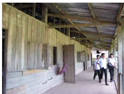
The school hallway