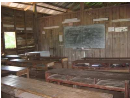
The interior of the school