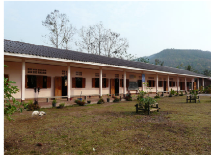
Welcome to the Tan Kham Secondary School