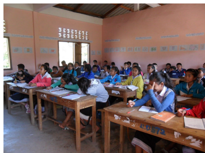
A new classroom will reduce overcrowding and fitting ceilings will reduce the noise from rain on tin roofs.