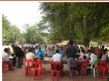
The community expresses their needs