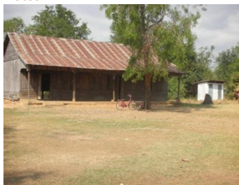
A rotten wooden building at Taphou