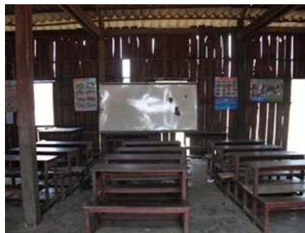
... the inside of the school