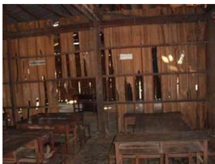
The walls separating class rooms