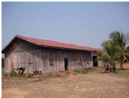
The outside of the school