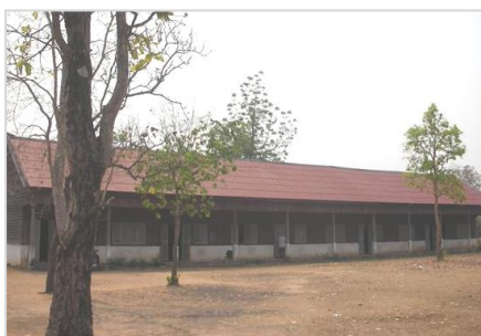
Welcome to Thnork Keng Primary School