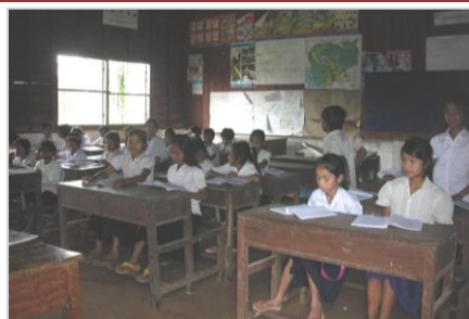
Students studying during classes