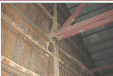
Termite damage inside the school building