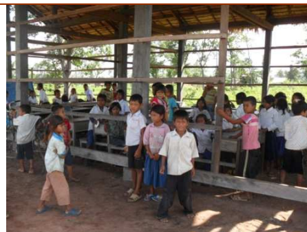
Meeting the children during our initial assessment