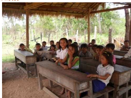
One of the classrooms with no walls