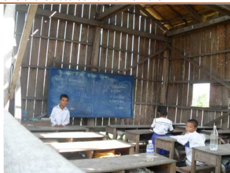
The classrooms were built by the community