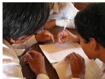
Students studying during classes