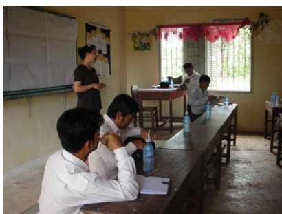
Meeting with the community in the school