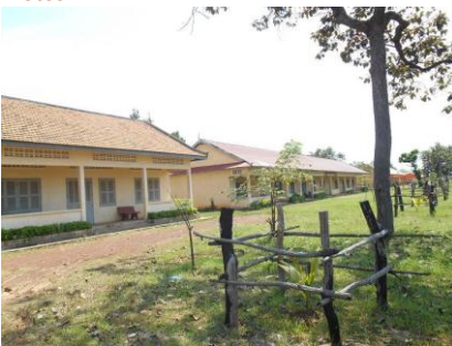
Welcome to Trapeang Prasat High School