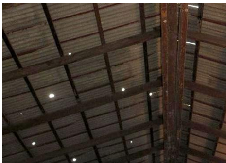
Big holes in the roof of the classrooms