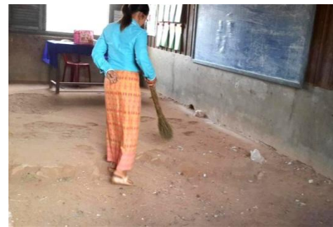
Dirt floors inside the classrooms turn into muddy patches during the rainy season