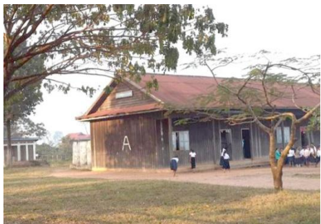
Building "A" is mainly made out of wood and is rotten