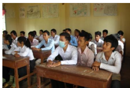
High school students studying inside the classroom