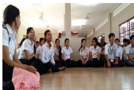
Boys and girls will have equal opportunities for study