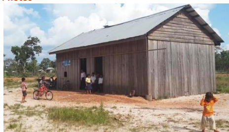
Welcome to Tuol Kruos Primary School