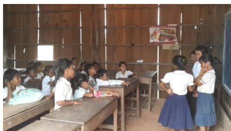
Classroom with dirt floors and one small window