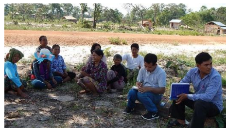
Meeting with the community at Tuol Kruos village