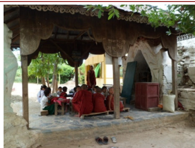
The learning facilities are outdoors and in a very poor state...

Welcome to U Yin Lay Kyaung Monastic school