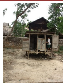
...as are the toilets