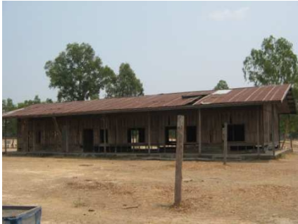
one of the old buildings