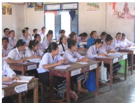
secondary school students in class