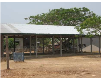
the started, but unfinished building