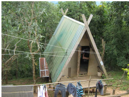
Different styles of boarding houses...