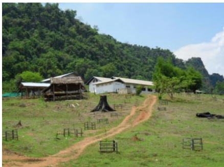
Welcome to Atxaiyaphoum Secondary School