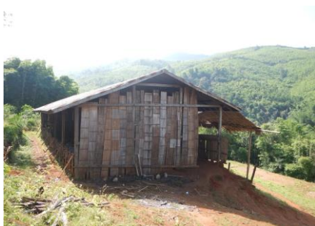
Situated in the jungle, access to the school is limited