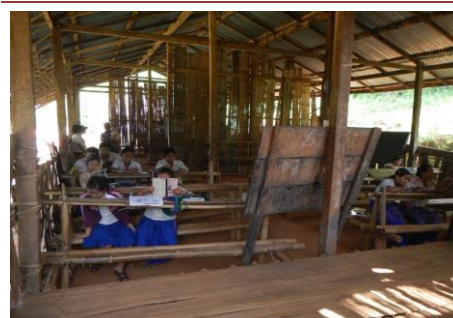
The infrastructure is rudimentary and insufficient for the students' needs