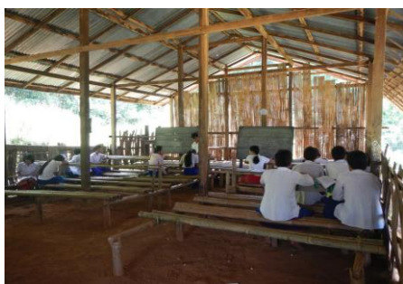
With virtually no walls, exposure to the elements inhibits the student's ability to learn