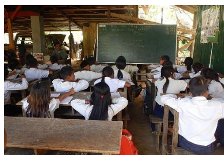
With little protection against the elements and with cramped desks, productivity is quite low