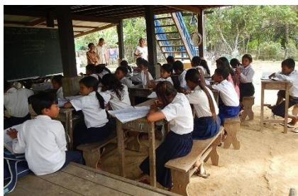
Classes take place at a local villager's basement