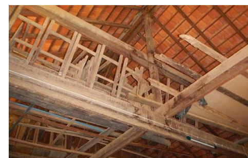
Due to old age, the school building will likely collapse and therefore not in use anymore