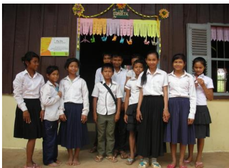
Welcome to Pa Ov Secondary School