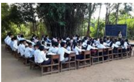
This class is being held outside due to lack of space