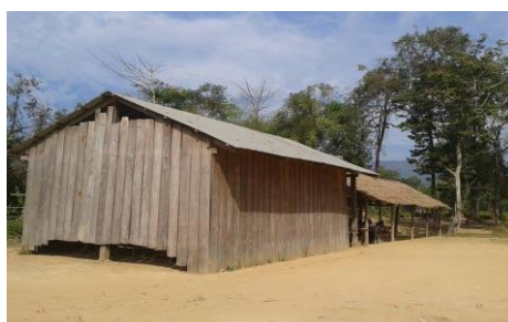
The two old school buildings are in bad shape