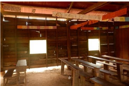
Classroom facilities are extremely basic