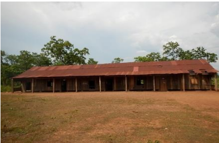
The current school building