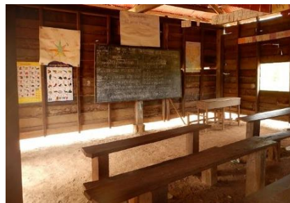
Classrooms have a zinc roof and are on a dirt floor