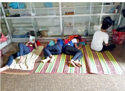
Some of the male students use the nearby temple as boarding house.