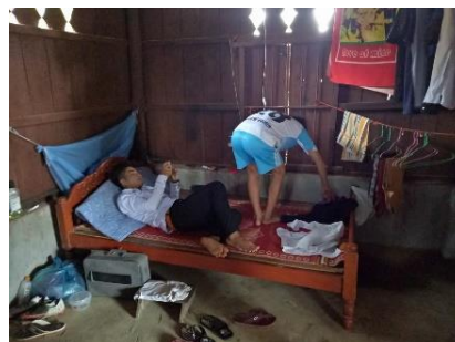
Some students are paying for accommodation with relatives, which hampers access for many.