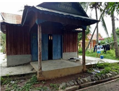
The library is used as a place to stay but is also in very bad condition.