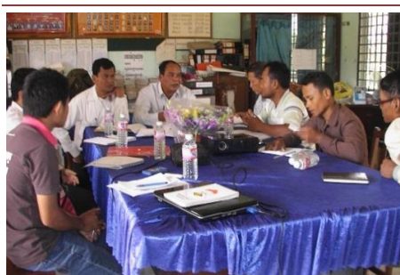
Meeting with the local community and school leaders