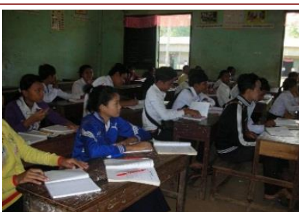
The young students of Srok Aek Phnom