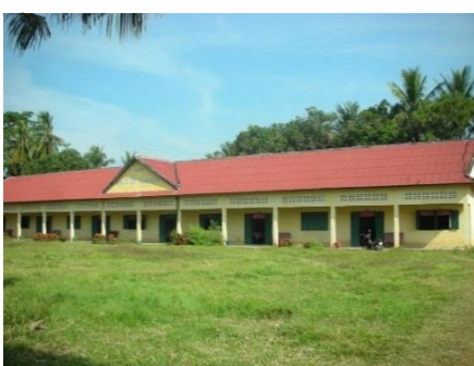
Srok Aek Phnom High School

We consider this project as low risk. The main risks would be the boarding house being utilised as a public area, and not for the students. In order to avoid this, a boarding house committee comprised of school staff and locals will be formed and trained. Construction is due to begin September 2015 and completion is expected by March 2016.