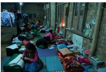
One of two existing, rotten boarding houses in Tin Hted village