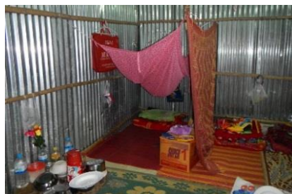
Living conditions for students remain bare, basic and completely inadequate