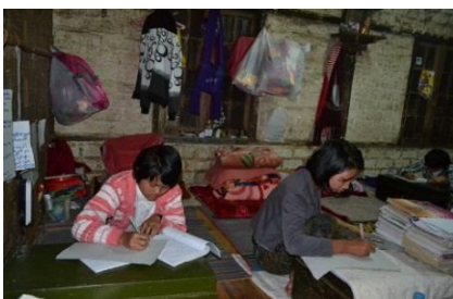
Girls from far away villages need boarding houses to continue their education