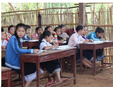
The young students of Pak Lueng have to deal with totally inadequate infrastructures