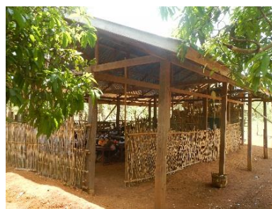
The rotten buildings provide little shelter against the heat, dust and rain