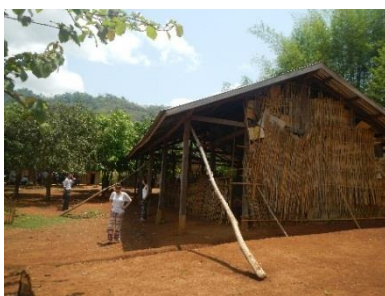
One of the four inadequate buildings