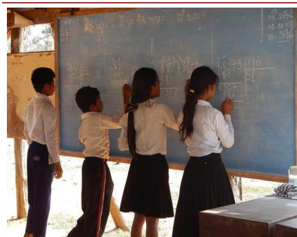
Students writing on the black board