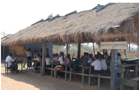
The rotten, temporary school building