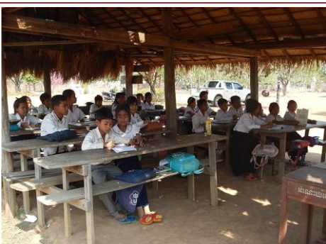
Inside the temporary school building