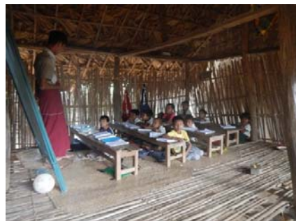
Primary school students attending class