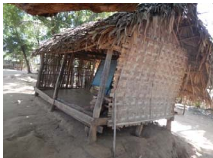
One of the deteriorating school buildings