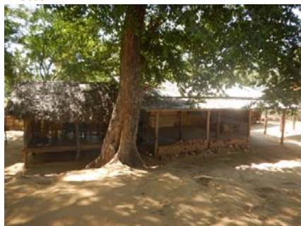
Welcome to Da Ma Rakita Monastic Primary School