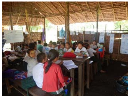
Students attending class