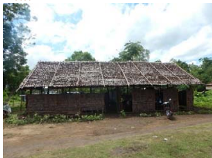
Welcome to Htee Huu Than School