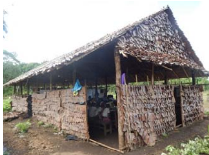
One of the deteriorating school buildings