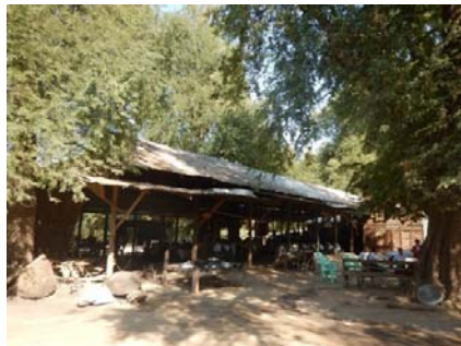
Welcome to Say Ta Na Monastic School