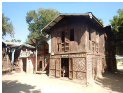
One of the deteriorating school buildings