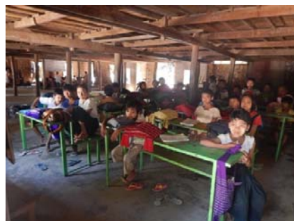
Students attending class in a dark classroom