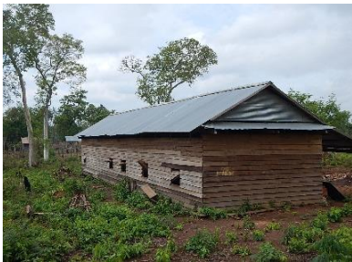
Welcome to Rom Chek Primary School