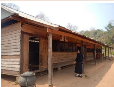
With only one building, classrooms are too crowded