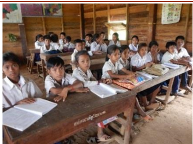
Dirt floors, wooden walls, and zinc roofs make up the current, rotten school infrastructure