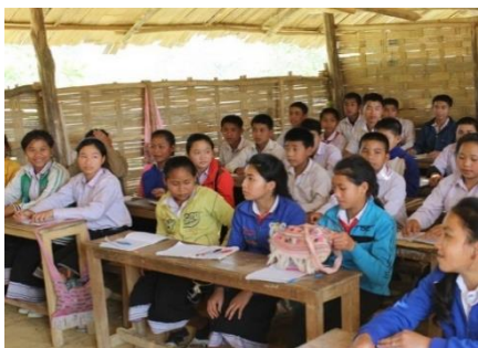
Classrooms are overcrowded and chaotic which impedes the childrens' education