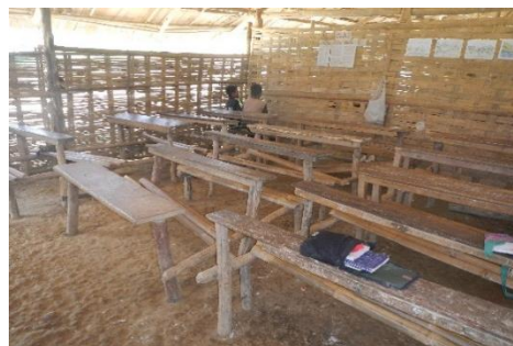
The classrooms built by the community do little to protect the students from harsh natural elements