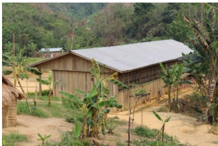
Nam Duan Lower Secondary School compound