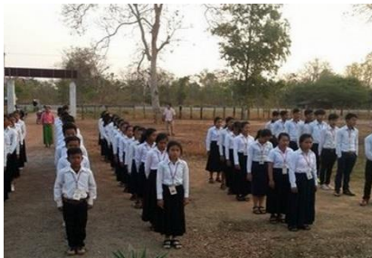
Students of Bos Secondary School