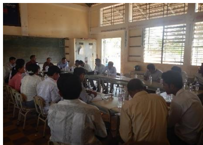
Our staff in a meeting with the local community