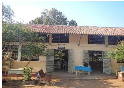
The Primary School Building