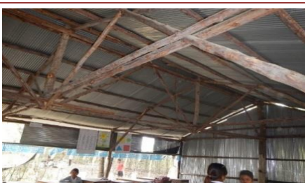
The building has deteriorated overtime and has become unsafe for the school children