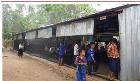
Students at Ou Romduol Primary School