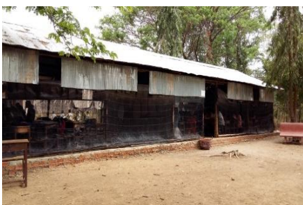
The existing, rotten Ou Romduol school building