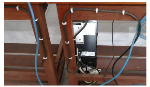
As you can see, the computers are still in good condition but require modernisation