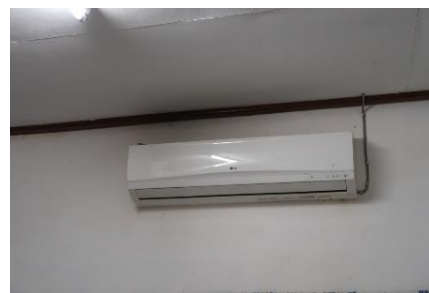
The functioning AC unit