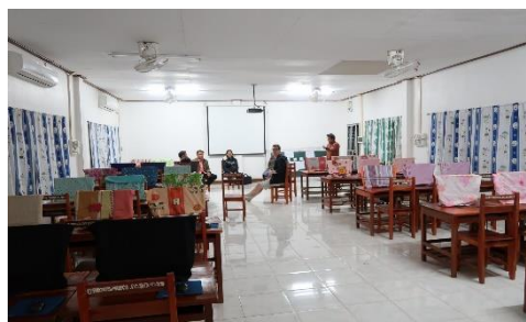
The existing computer lab