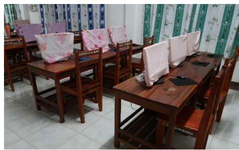
A photo of the computer laboratory