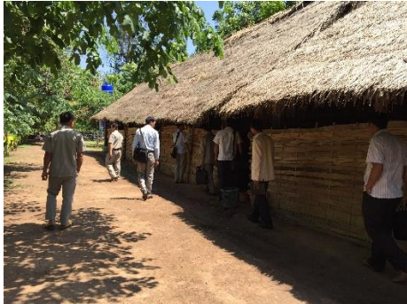
The temporary school building at Pang Hai Secondary School. Given the harsh weather conditions, this facility is inadequate for students.