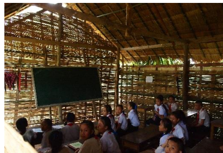
These classrooms are overcrowded and leak during the rainy season. This makes it difficult for the students to pay proper attention. Such facilities also pose a health risk to the students.