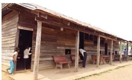
The building has deteriorated overtime and became unsafe for the school children.