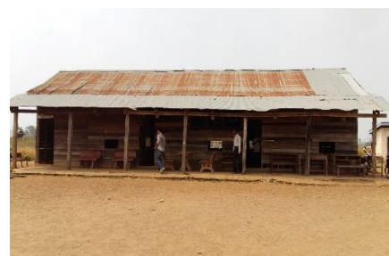
The temporary school building