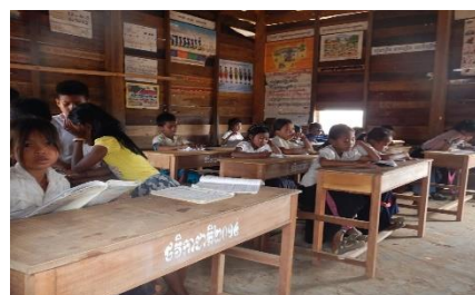
The classrooms are overcrowded and unhygienic. During the hot season the dirt floor becomes very dusty