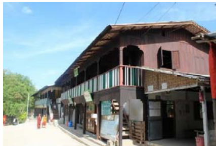
Welcome to Zin Nya Kan Baw Za Monastic Primary School - Myanmar