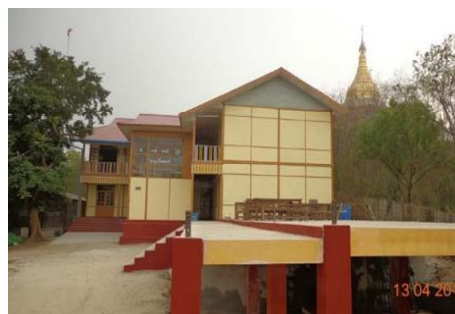
We built these classrooms and the foundation in 2013