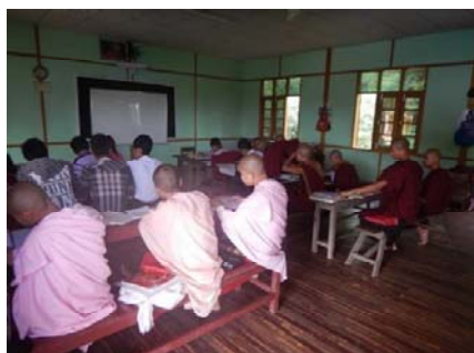
This schools offers education to over 500 students