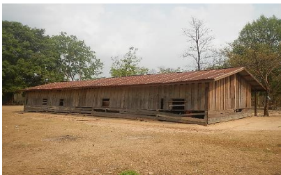
The current school building is poorly constructed and unsafe for the students