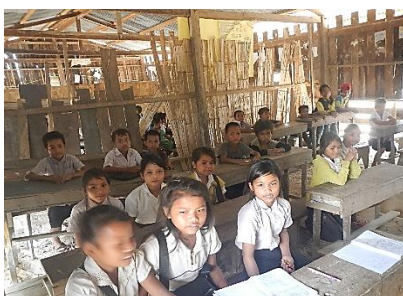
The classrooms are unhygienic and chaotic