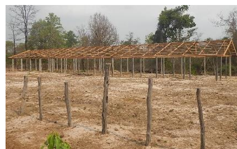
The current situation of the halted building construction